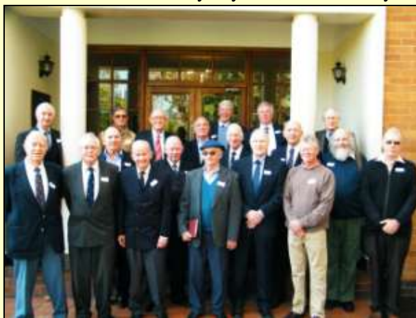
Old Stithians of the first five years