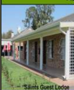
Saints Guest Lodge

Below are the half day and full day rates for conferences in the main conference centre.