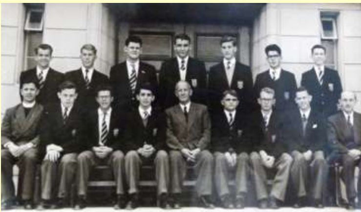
First Matric Class of 1956