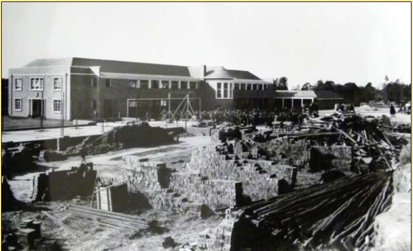
Official Opening 1953