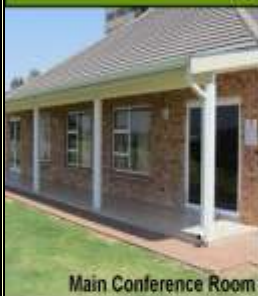
Main Conference Room

The One & All Club at St Stithians College offers conveniently located conference facilities, seating up to a maximum of 100 delegates in our purpose-built conference centre, adjacent to Higher Ground Restaurant. Situated in private and secure surroundings of St Stithians College, the conference centre has its own deck and enjoys an amazing view over the Sandton skyline.