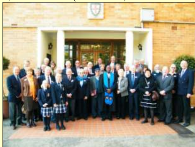
With wives and grandchildren