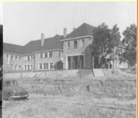
Founders' Day 1953