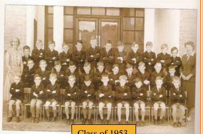
Class of 1953