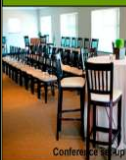
Conference set up