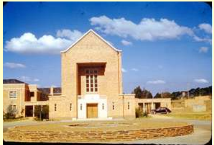
Chapel – 1958/59