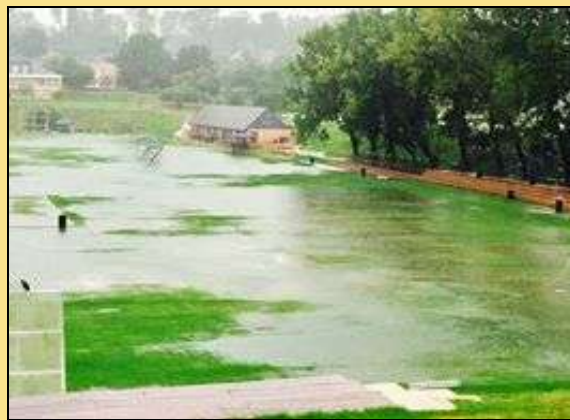
Water logged fields after heavy rain on 3 February 2014