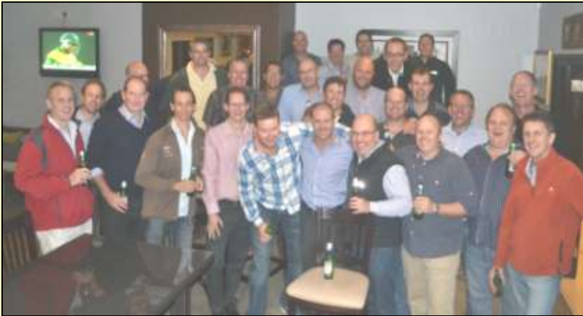
The Class of 1988 had their 25 year Reunion on Friday 1 November at the One & All Club