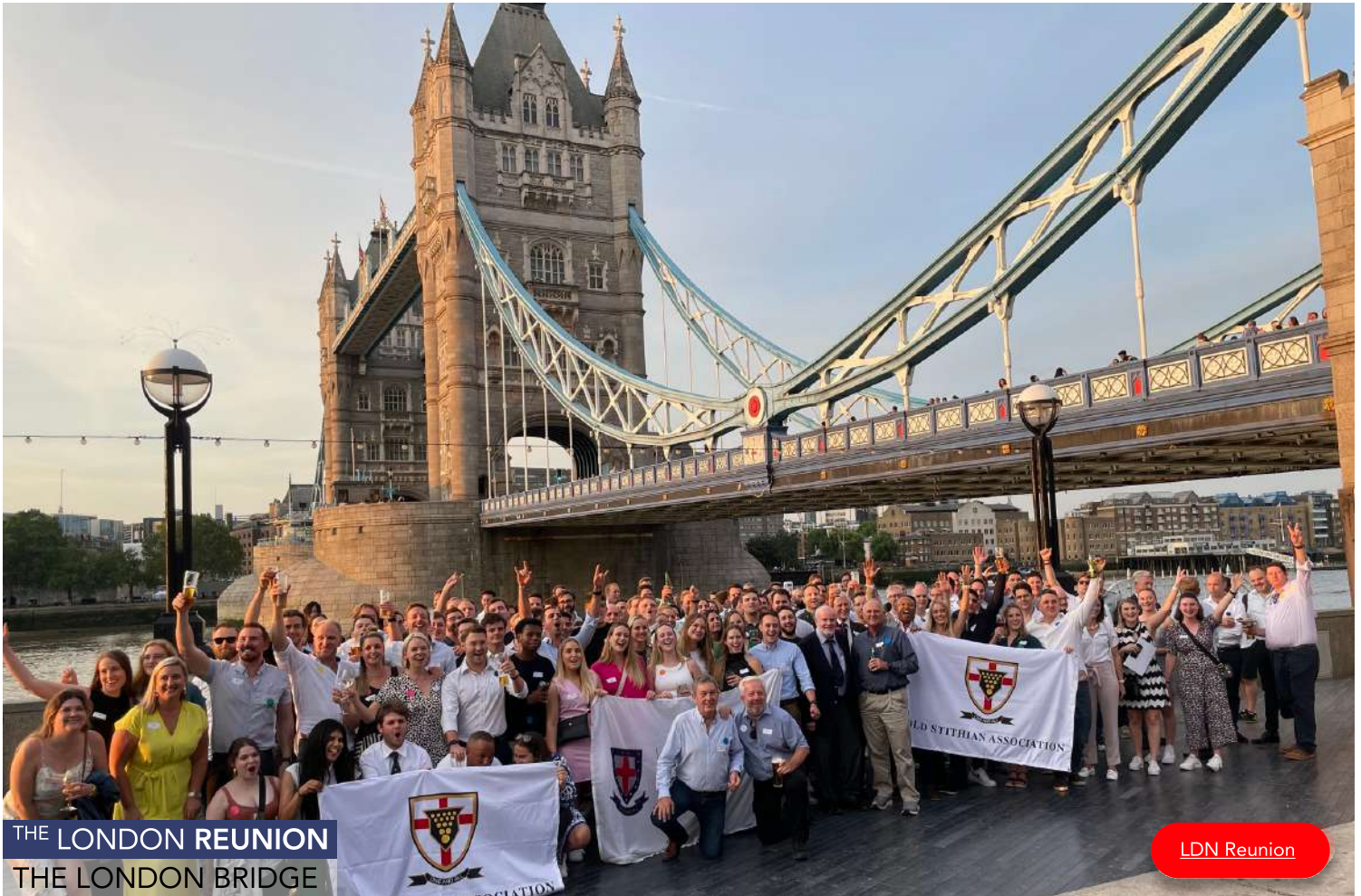
THE LONDON REUNION THE LONDON BRIDGE