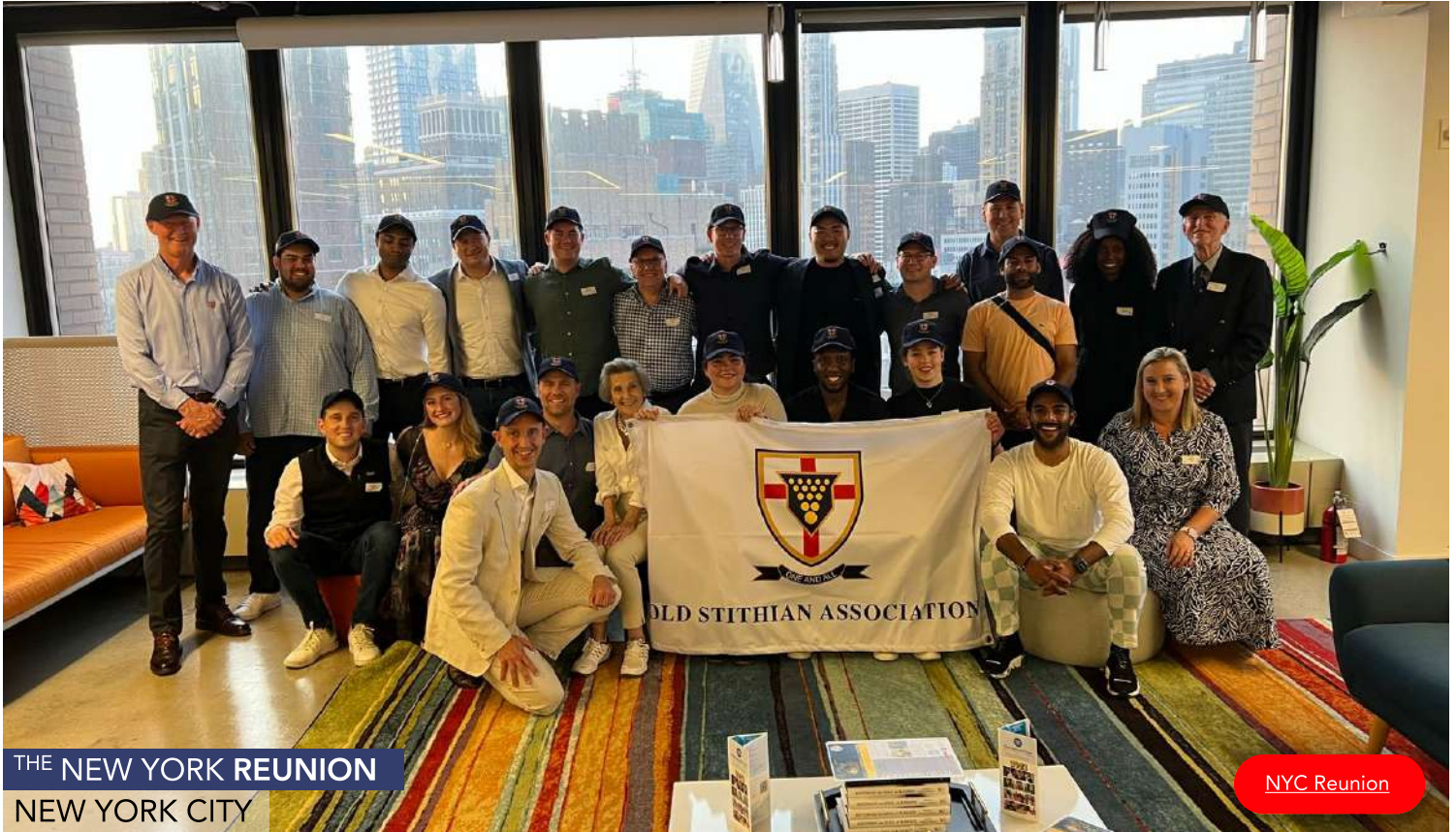
THE NEW YORK REUNION NEW YORK CITY