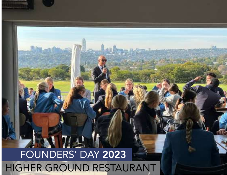
FOUNDERS' DAY 2023 HIGHER GROUND RESTAURANT