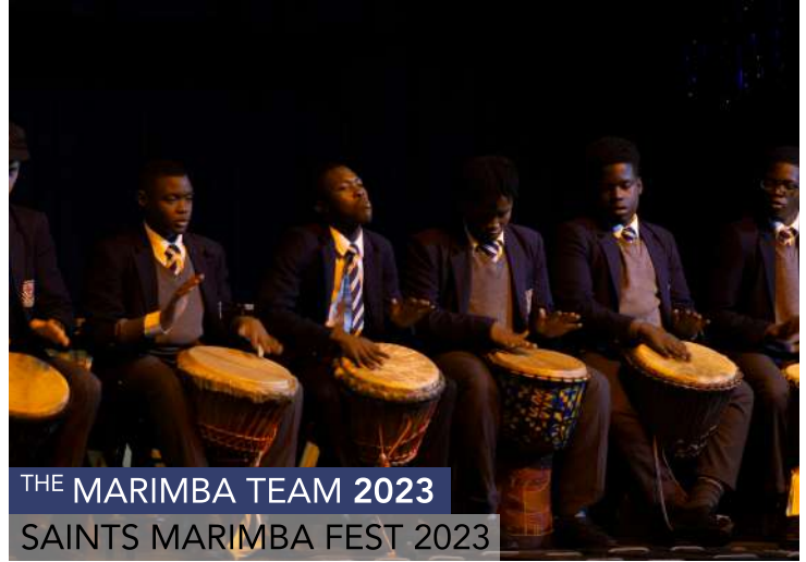
THE MARIMBA TEAM 2023 SAINTS MARIMBA FEST 2023

On the 13th and 14th of June, St. Stithians once again hosted the annual Marimba Festival. The festival is split into two days, one day for the College and one day for the Prep. The College fest took place first and it was a spectacular showcase of music featuring St. Stithians Boys' College, St. Stithians Girls' College,