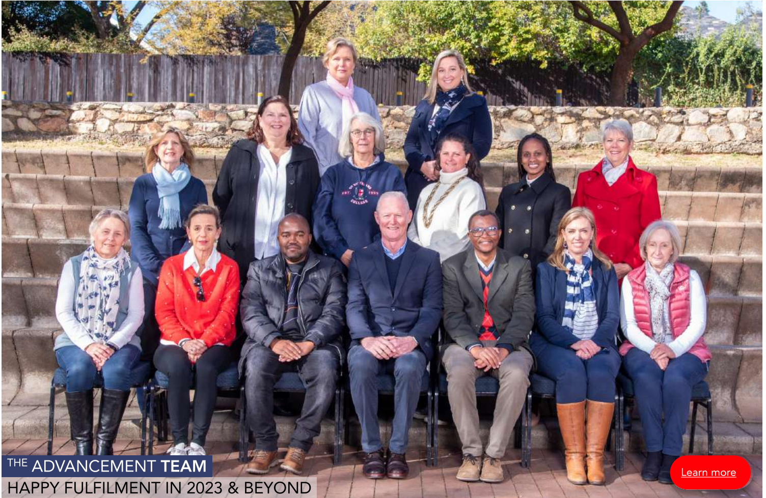
THE ADVANCEMENT TEAM