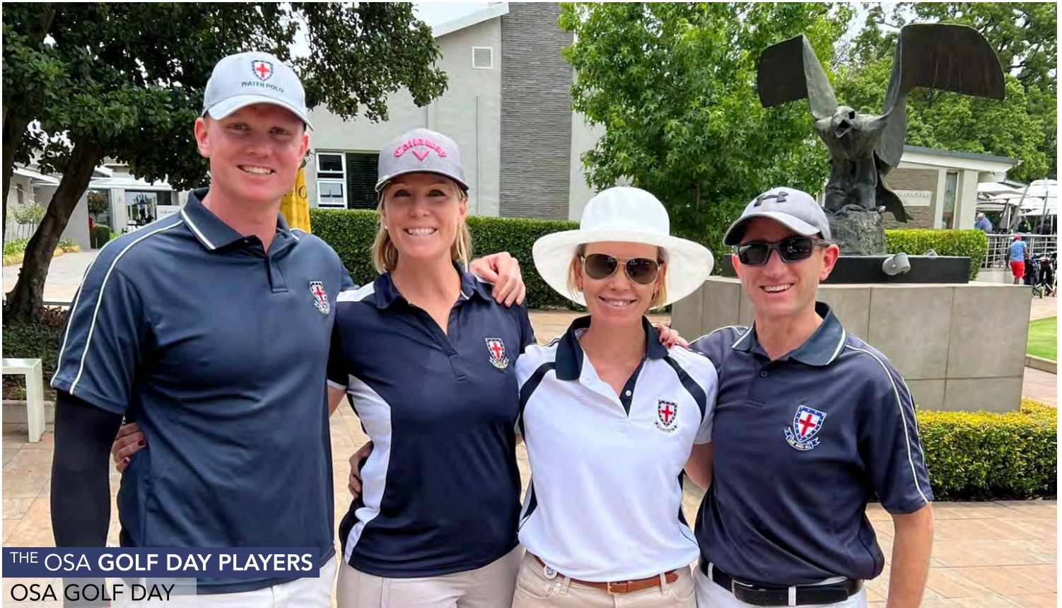
THE OSA GOLF DAY PLAYERS OSA GOLF DAY