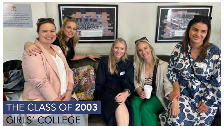
THE CLASS OF 2003 GIRLS' COLLEGE

The Old Girls thoroughly enjoyed the assembly and tour, especially as they saw how much the school had changed and grown.