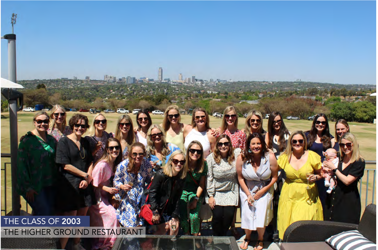
THE CLASS OF 2003 THE HIGHER GROUND RESTAURANT