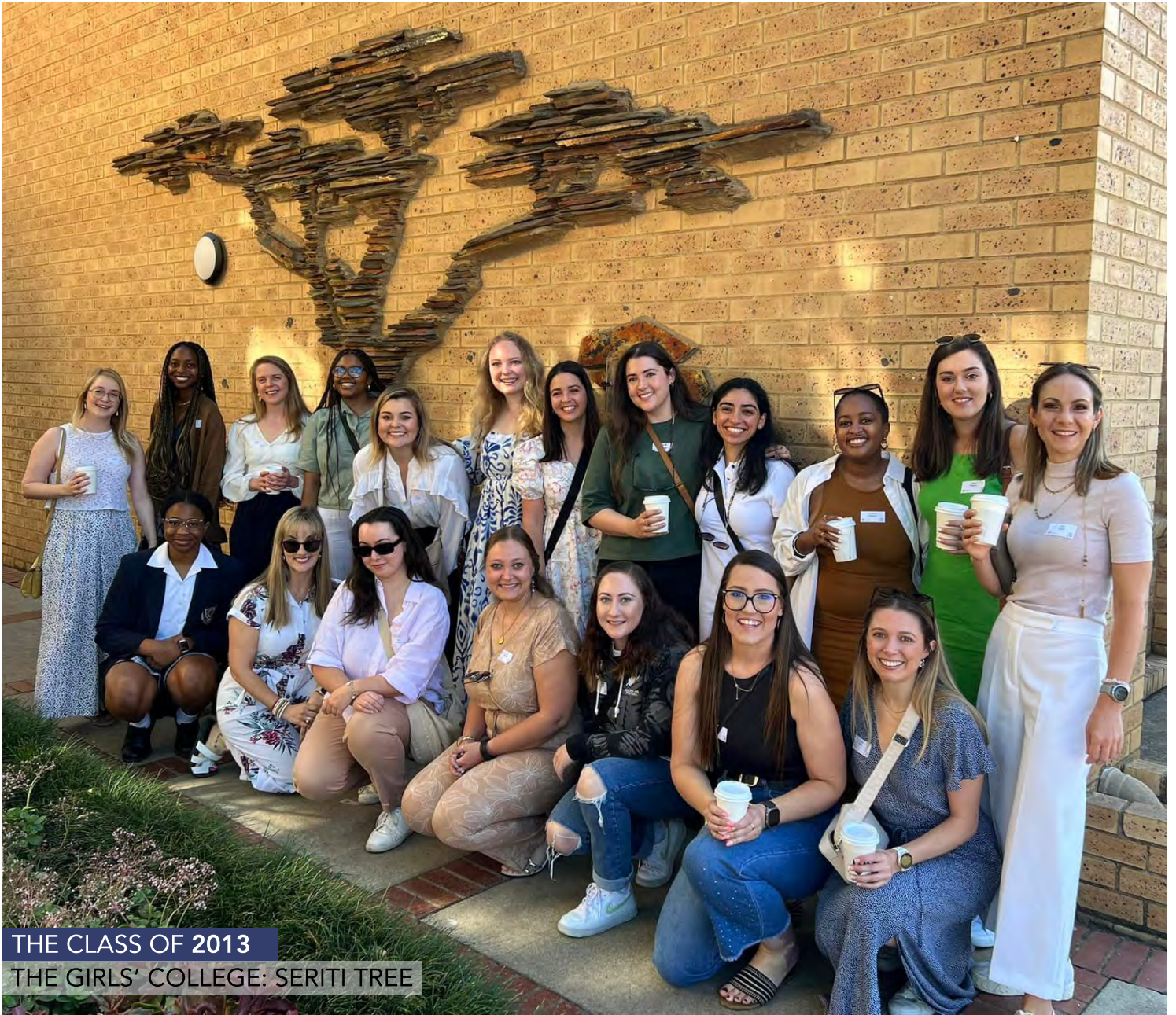
THE CLASS OF 2013