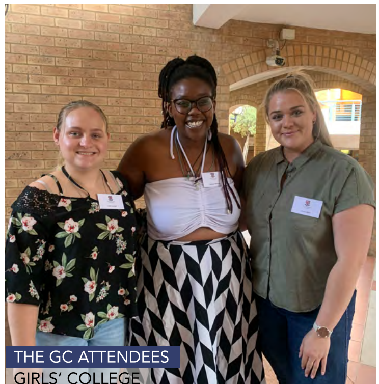
THE GC ATTENDEES GIRLS' COLLEGE

We appreciate their time and commitment to giving back and guiding the young professionals of the future.