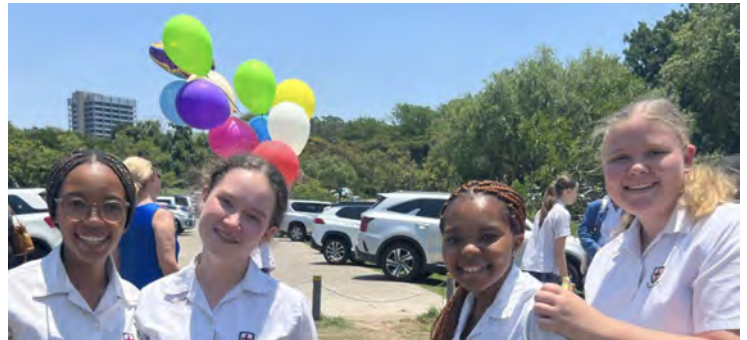
THE CLASS OF 2023 CELEBRATING IEB NSC EXAM END

We are holding thumbs for an excellent set of results on release day come the 18th of January next year! There was much jubilation on Thursday 23 November when the Class of 2023 finished their final English examination, a huge achievement in the life of every student!