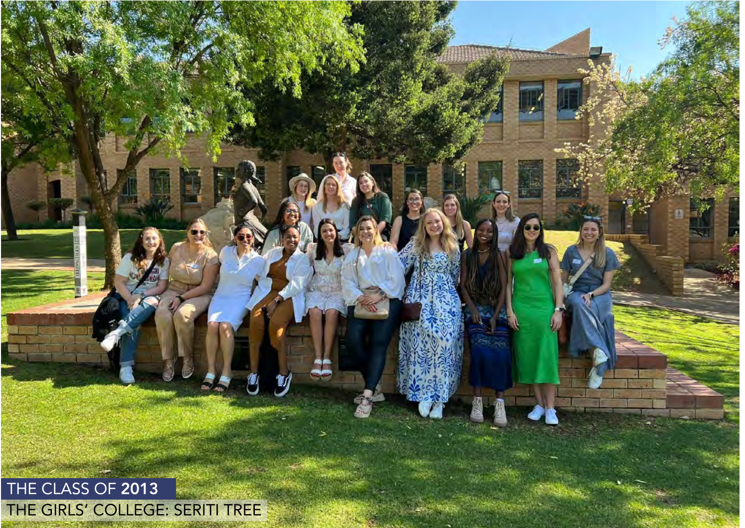
THE CLASS OF 2013