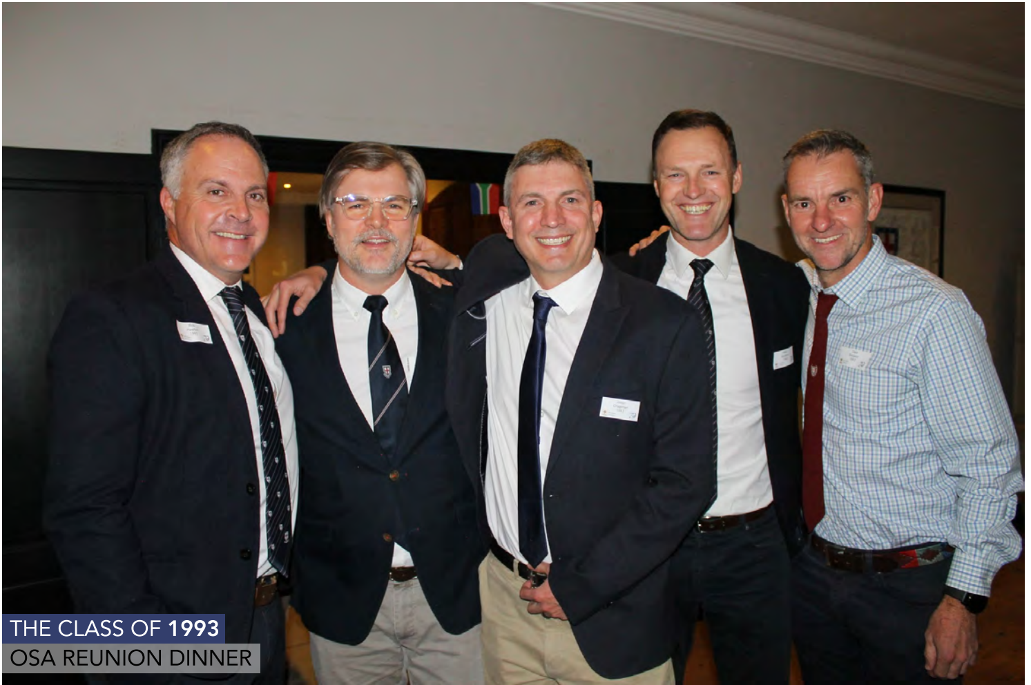
THE CLASS OF 1993 OSA REUNION DINNER

He commended the school on its growth and diversity, and expressed his pride in being an Old Stithian.