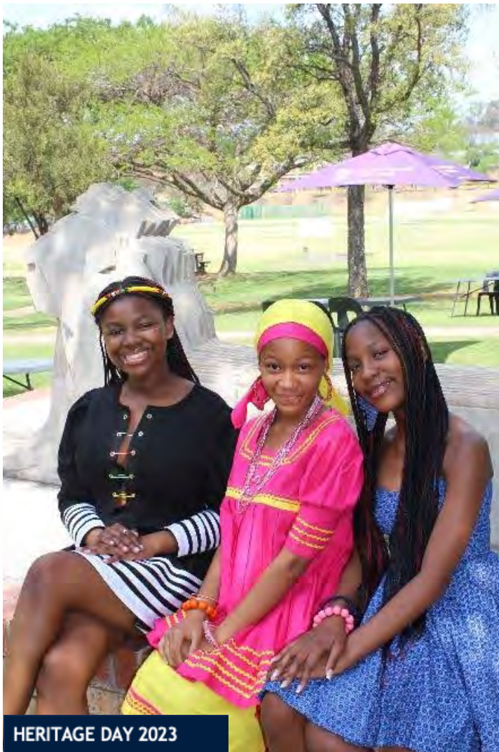
HERITAGE DAY 2023