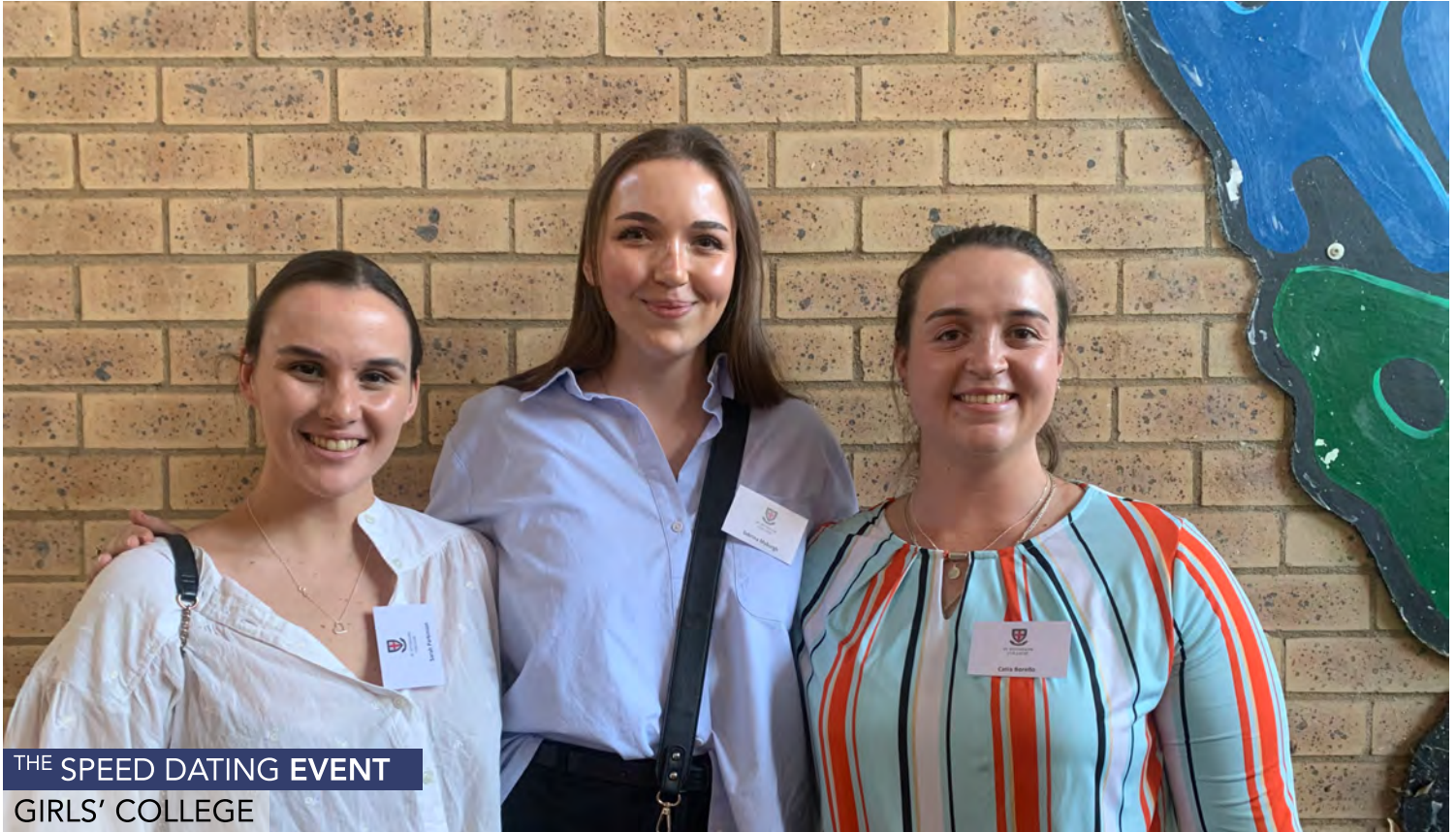
THE SPEED DATING EVENT GIRLS' COLLEGE