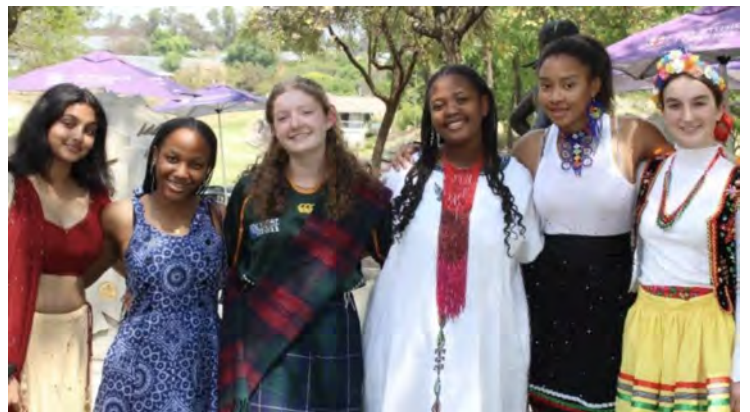
GIRLS’ COLLEGE STUDENTS CELEBRATING HERITAGE DAY 2023

Over the past few months there have been many opportunities for our girls to stretch themselves, find new challenges and importantly reflect on all that they have achieved. Heritage Day this September was a glorious feast and celebration of all that makes us unique. Our staff and students worked hard to prepare a Heritage Fair which consisted of several interactive workshop events including dance workshops, and a heritage quiz activity to name a few.