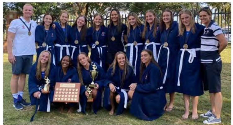
THE 1ST TEAM WATER POLO OF 2022/3 GC SPORTS TEAM OF THE YEAR

Reflecting on Girls' College sport this year, we can be proud of the many individual achievements as well as the success of many of our team sports. During this year we have a number of accolades which stand out including winning the Buffalo Rowing Regatta in February this year, our First Team Water Polo team remain unbeaten this year, winning the St Anne's tournament over the Heritage weekend and the Roedean Old Mutual tournament means that we have won all major polo tournaments this year.