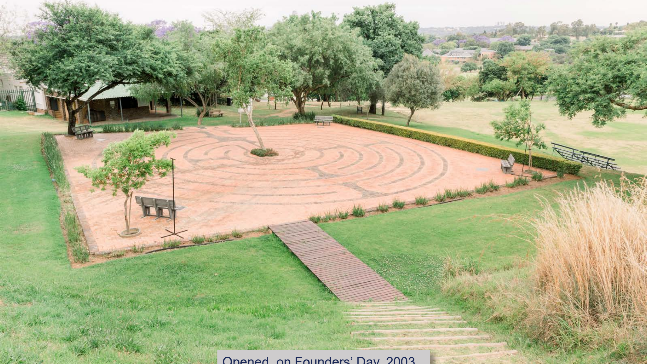
Opened on Founders' Day, 2003

The Labyrinth was constructed and opened at the request of the Round Square (RS) Committee who, in that year hosted the RS International Conference. It follows the Santa Rosa design, 20m in diameter. The original construction with gravel pathways separated by dietes grandiflora planted by GC students was eventually replaced with brick paving. RS conference delegates planted the dietes on the perimeter.