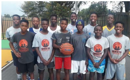
Morris Isaacson Warriors team for the u16 St Sithians Boys' College 2020 Tournament

The School Basketball Team is known as the Morris Isaacson Warriors