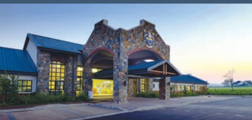
Reddam House Helderfontein Reception: 010 060 4232