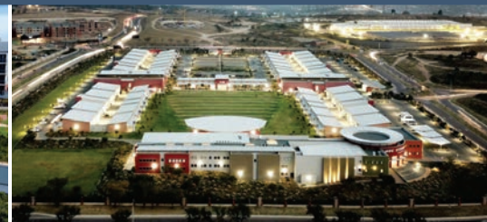
Riversands Incubation Hub Reception: 011 012 4600