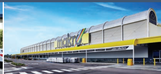
Makro Riversands Switchboard: 0860 600 999