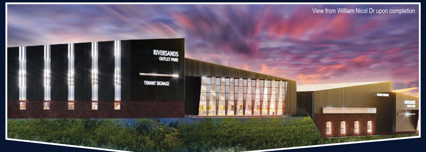
View from William Nicol Dr upon completion