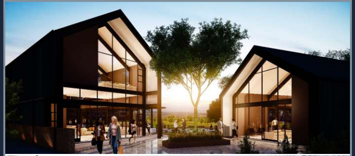
Crowthorne Corner Clubhouse with Gym