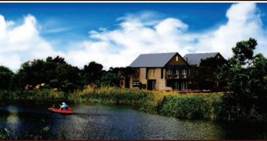
Helderfontein Estate Residential Stands in Dainfern/Fourways Area