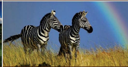
The Hills Estate Large Residential Stands off Garsfontein, Pretoria

For more information on any of these developments, contact us on 0800 736825