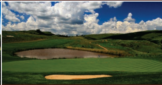
Highland Gate Golf and Trout Estate in Dullstroom