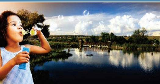
Waterfall Country Estate/Village Large Residential Stands and Completed Houses

Other exciting SALES projects currently on show by Century Property Developments: