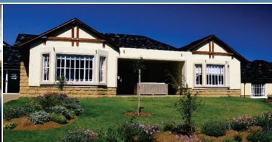
Waterfall Valley Mature Lifestyle Estate Luxurious Freestanding Retirement Houses