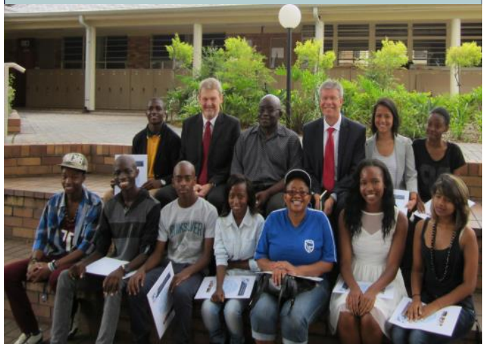
The top Grade 12 Achievers of 2014 were recognised at the Thandulwazi prize-giving held on 31 January 2015