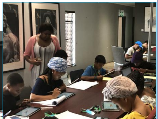
Mathletics sessions (above)