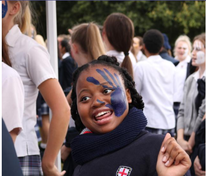
THANDULWAZI SCHOLARSHIPS, 2018