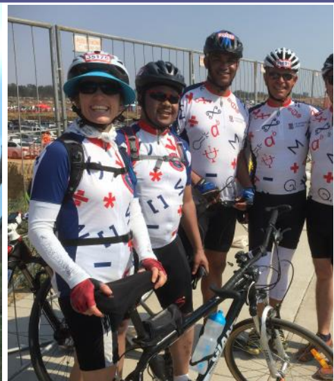
THANDULWAZI HIGHLIGHTS, 2015