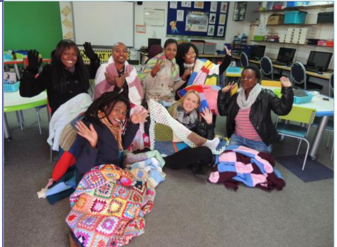
The Thandulwazi Foundation Phase Interns knitted blankets on Mandela Day, 18 July 2015

“Teachers are fundamental to the quality of schooling in South Africa” (Nic Spaul)