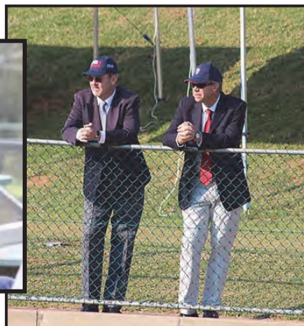
Head's and students enjoying the sport