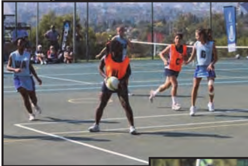
Some of the sporting codes