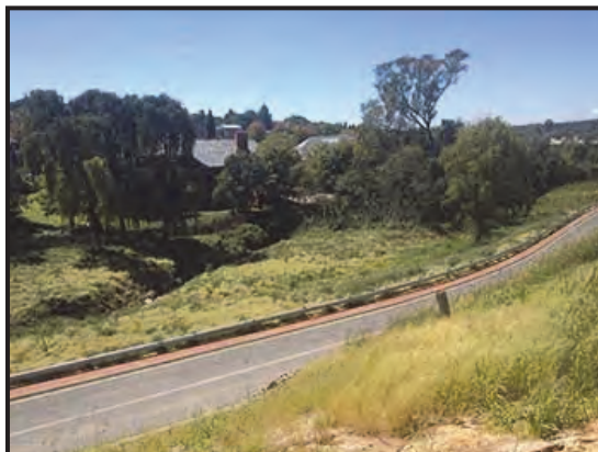
Rehabilitated land next to the Peter Place entrance

The forest below Peter Place, adjoining the bird sanctuary has been rehabilitated in recent months. Alien trees such as black wattle, poplar and blue gums have been removed, as have other invasive plants. The site was toxic and devoid of insect and bird life, the plants choking the waterways. As custodians of the site, St Stithians have rehabilitated the land and water flowing through the property is now filtered and cleaned using natural eco systems before entering the Braamfontein Spruit. The area will now be filled with quality material and over 300 trees planted; the area will be hydro seeded with 25 different types of indigenous grasses. Eventually the original wetland will be re-established giving life to a variety of birds and insects.