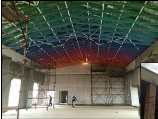
Junior Prep Hall