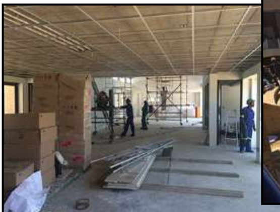
Girls' College art classroom