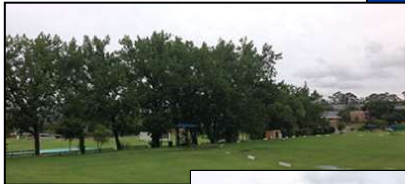
St Stithians campus; green and lush after the rains

*Seriti is a Sesotho word referring to the shadow/legacy that we cast.