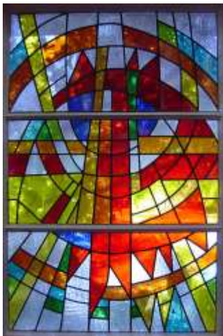
"Joy"; one of the Chapel windows

As staff members of this College, we lead and share the passage through Saints of every child, a rewarding cyclical investment and shaping of young lives as succeeding generations pass through our doors. As we give greater emphasis to each staff member having a personal growth plan, informed by performance management and destinations of development, the cycles of the school year become steps on a journey for the adults in our school community.