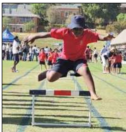
JP sports day