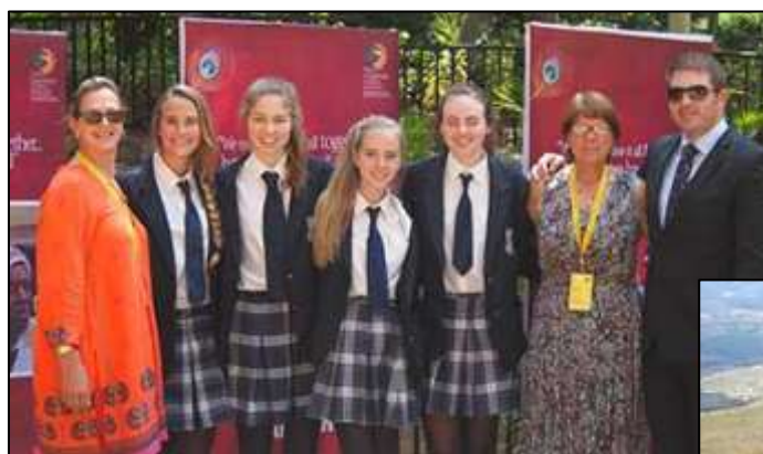
Saints delegates at the Round Square conference, India