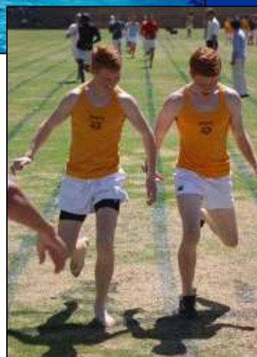
BC twins hitting the line together!