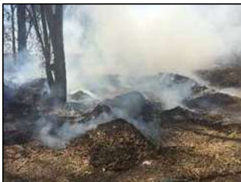
Fire at the recycling centre