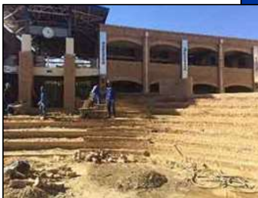
Work-in-progress: Girls’ College

The Physiotherapy rooms currently located in the HPC will be moving shortly to the D&T block. A section of the building has been renovated to accommodate the Physiotherapy rooms and a new on-site clinic, which will mainly be for the use of College support staff. The use of a basic life support paramedic on-site is also being trialled from 12h00–18h00, Monday to Friday and from 07h00–13h00 on Saturdays. The paramedic will focus on campus sporting events, attending to any injuries and referring to hospital as required. The paramedic is not allowed to administer medication or drips, but is qualified to stabilise a person, whilst waiting for an ambulance if required.