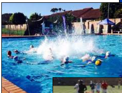
GC water polo