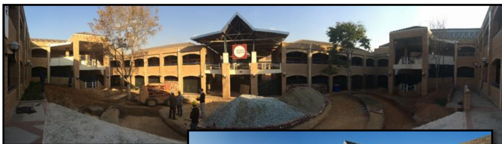
Girls' College Quad / Amphitheatre Building Site