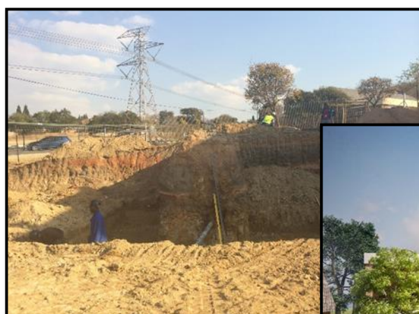
Building Site of the New Hall for the Junior Prep