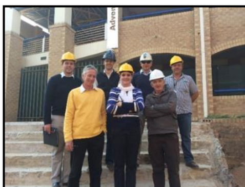
The Project Team