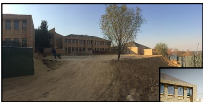
Girls' College Art Classroom Building site

I would like to take this opportunity to thank the staff of the Ops team for their hard work and dedication.