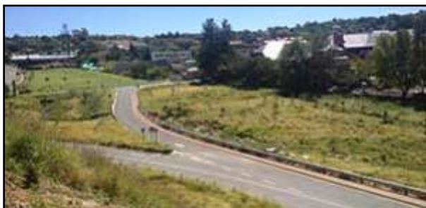
The new ring road