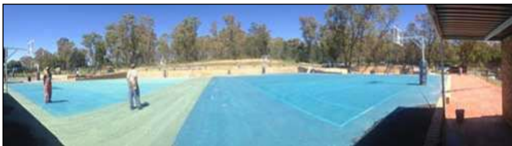
The new basket ball courts