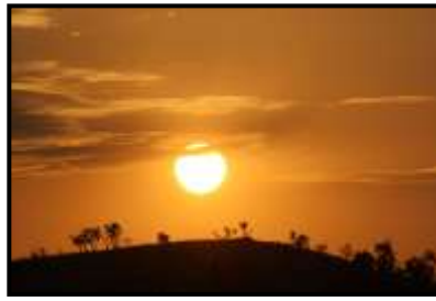
Sunset at Kamoka

The Girls' College information evening was held in March and the Boys' College information evenings will be held on 20 May and 30 September and details will be communicated closer to the time. The website has been updated with current documents and the Kamoka brochure will be distributed at the relevant parent evenings.