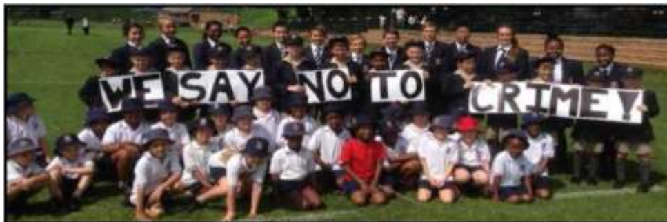
Students with their STOP Crime posters

On the 19th March this year, all five schools on campus came together to take part in the Stop Crime campaign. The event was initiated by an ex Girls' College pupil in Matric, who wanted to bring together all the students and staff in order to protest against the growing crime rate in our country. The organisers were the student Transformation Committee in the Girls' College and the Inter-School Relations Committee in the Boys' College. (continued)