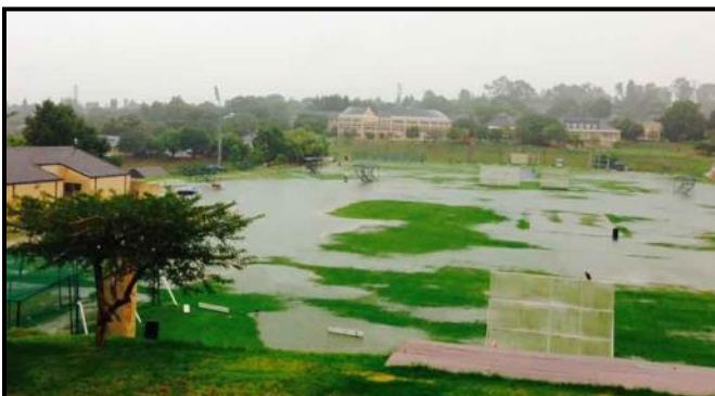
Saints afloat after recent heavy rains

...but the resident geese were very happy!