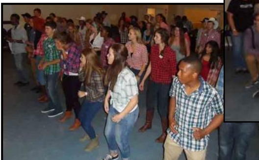
2014 Matric student leaders learning the steps at the Rector's barn dance