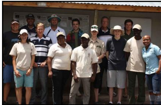
BP staff at Kamoka

The grade 7 boys from the Boys Prep recently held their leadership camp at Kamoka Bush School. A big thanks to all the staff from Kamoka, the Boys' Prep & even three visiting students from Cornwall, who looked after the boys during their 4 day stay.