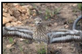
And an unsure resident!

The clean up of the bird sanctuary on 28 September was well supported by over 300 students, parents and sponsors. The enthusiasm was fantastic! Over 100 trees were planted, dozens of bags of litter and alien plants collected and 3 waterless toilets donated and installed. Many thanks to the sponsors of the refreshments, tools and staff and to everyone involved. Thank you for making a difference and we hope to make this a termly event.