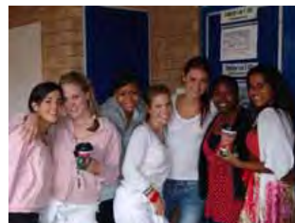
Committee in action